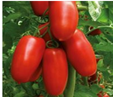
FIG.1 Healthy San Marzano tomatoes

Our investigation wants to understand if the abiotic factors which characterize this physiopathy, have been limited in years and if we can think about a returne to the full agricultural production of our product, or if these characteristics will remain and will cause still damages to the production.