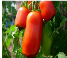
FIG.2 Healthy San Marzano tomatoes with BER