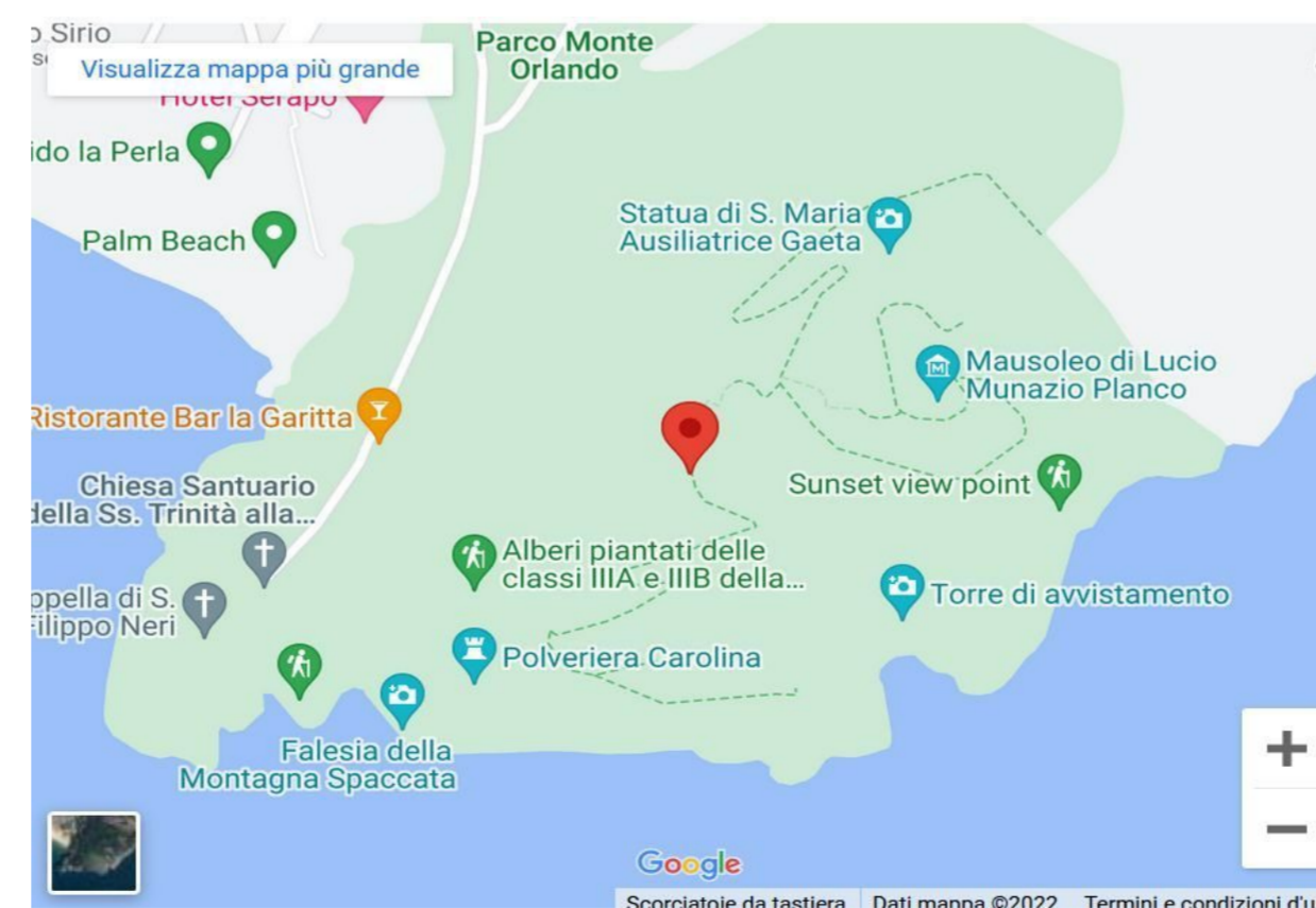
Figure 3: Location of planted trees

The last step is called "Making a Difference". After understanding the causes of global warming, it is important to become agents of climate change and this can be achieved only through a widespread dissemination of data that are periodically provided on climate change and set a good example to achieve one of the objectives set at the end of COP26: contain the increase in temperature not more than 1.5 degrees, accelerating the elimination of coal, reducing deforestation and increasing the use of renewable energy. Thanks to the active collaboration with the Park Rangers of the protected area of Monte Orlando, we were able to plant 4 Aleppo pines as an example of good practice to be followed in other cities. We have designed and created a 3D paper model reproducing the vegetation of our Park of Monte Orlando to spread on the site a printable pdf. We have also created a pocket book entitled "Let's make a difference...even a child could do it" to spread small gestures useful to achieve energy savings. At the end of the path we realized that we are very lucky to live in a city where there is a protected area that has the function to safeguard nature and our health. But the "climate change sentinels" are trying to tell us that the climate is changing and that we must not waste any more time, we must act because only by acting we can make a difference and save life on Earth.