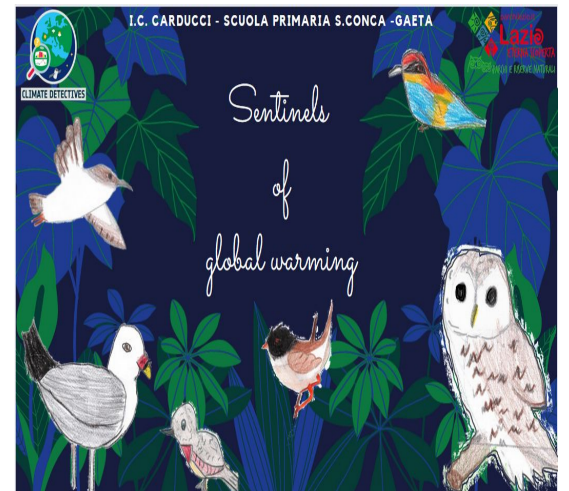
Figure 2: Cover ebook that collects all the data